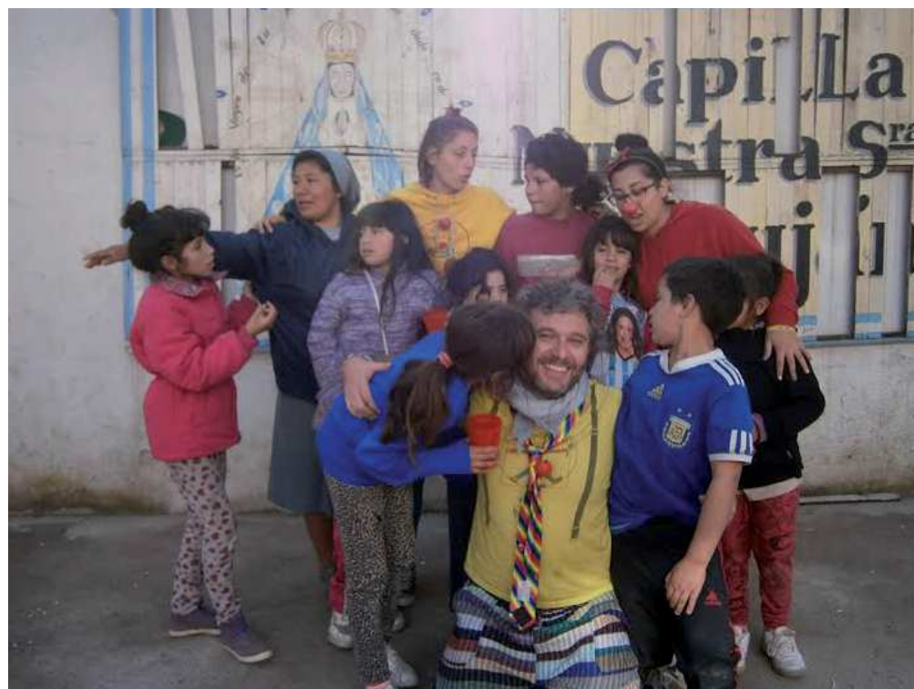
Community of San Luigi, Buenos Aires - Argentina

We thank the Religious Family for giving us the confidence by sending us to form this new community and sustaining us with prayers of all the Sisters.