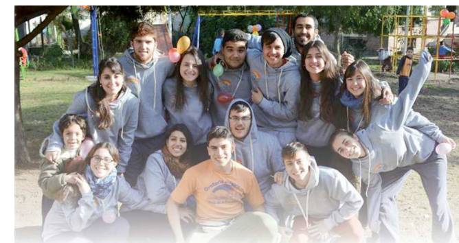
A HOUSE AND A HEART OPEN FOR THE YOUTH (Montevideo - Uruguay)

The word consumerism, too often abused or used in a moralizing sense, indicates, in addition to exaggerated and disproportionate consumption a mindset about